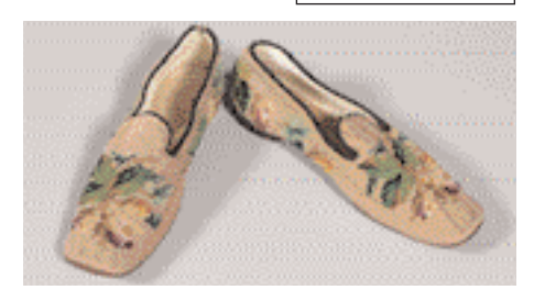
Fig 10. A pair of Berlin wool-worked and silk embroidered gentlemen's slippers, circa 1860, with shaped soles, the uppers worked in golden silk in tent stitch, and purple roses in cross stitch, 28cm, 11in. (2) £150.