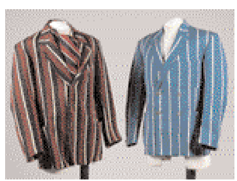
Fig 9. Menswear, 1930s-60s, comprising an Austin Reed voluminous brown plush 'teddy' coat, dated 1934, chest 112cm, 44in, two striped blazers, one by Jackson the Tailor, cravat, striped cotton swimsuit and a Radiac nightshirt, and a pair of Army issue white thigh high canvas boots dated 1943. (qty) £1,700.