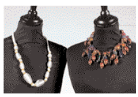
Fig 18. Yves Saint Laurent Rive Gauche jewellery, late 1970s-80s, comprising: a facetted glass bead and wooden bead necklace; a lacquered pendant (probably Chinese collection), another with carved shell pendant, a chunky glass bead necklace on eau de nil silk rope. (4) £650.