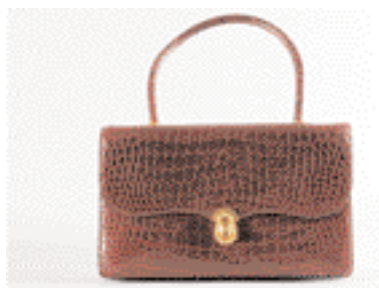
Fig 15. An Hermès wine crocodile 'Escale' bag, late 1960s, Crocodylus Porosus, stamped in gold 'Hermès Paris' below the front pocket, gilt ropetwist loop and button clasp, 27cm, 10.5in. £1,900.