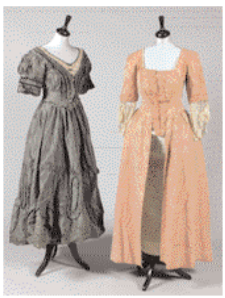
Fig 12. A general group of Victorian/Edwardian women's clothing, including the remains of a Valenciennes inset bridal gown c1900, assorted bodices, all with wear. (qty) £120.