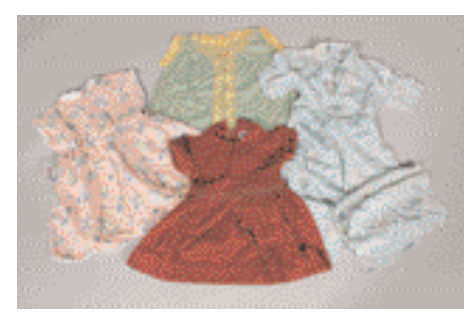
Fig 4. Children's wear 1920s-40s, including boy's sailor suit with straw hat and painted sailor hanger; burgundy wool Utility marked dress, 1930s party dresses and pyjamas. (qty) £160.