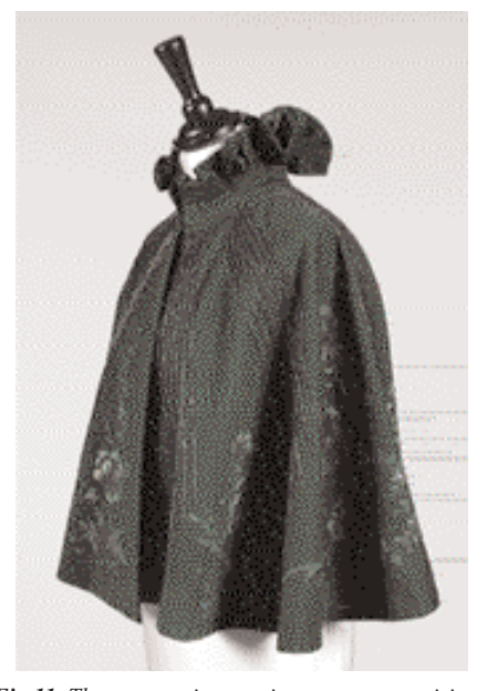
Fig 11. Three attractive evening capes, comprising: green felted wool capelet c1890, hand painted with blooms, iridescent beading; an ivory ostrich feather and satin capelet, a magenta draped velvet evening jacket, both 1930s, together with a pheasant feather belt and a speckled ostrich feather boa. (5) £600.