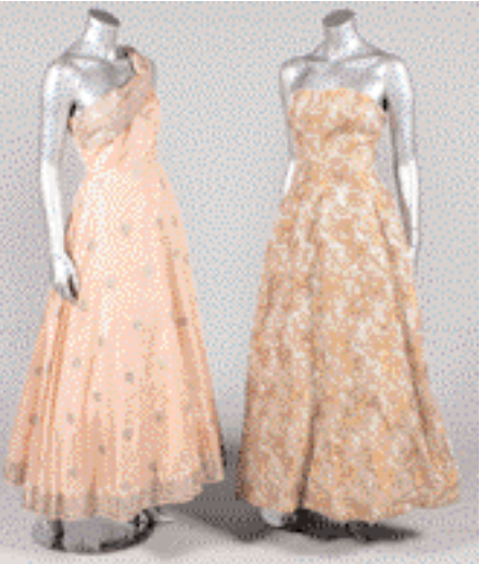
Fig 7. The contents of an attic trunk, including four 1930s velvet and satin evening gowns, peasant-style embroidered blouses, two 1950s ball gowns, assorted gloves petticoats etc. (qty) £600.

Kerry Taylor Auction October 16th 2012 All prices hammer.