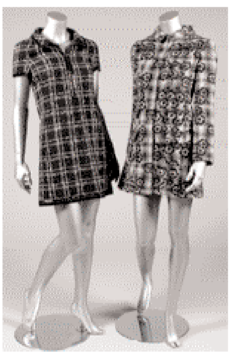
Fig 2. A Chanel black and white checked dress, zip-fronted, edged in black leather, together with a grey and white wool coat with black flower pattern, chests 82-86cm, 32-34in. (2) £650.