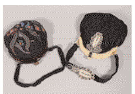
Fig 8. Five evening bags, including a heavily beaded 1920s example, another with ivorine clasp, 1930s petit point with carved hardstone butterfly, and three belts. (8)

Kerry Taylor Auction October 16th 2012 All prices hammer.