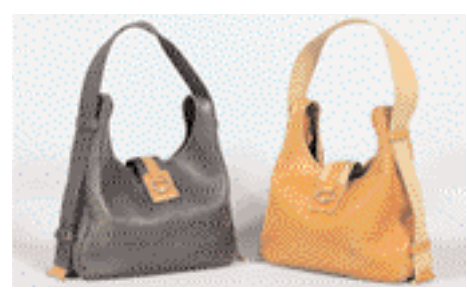
Fig 16. Two Hermes shoulder bags, 1970s, each with maker's stamp to the closure, in tan and and black leather, with cotton webbing straps and gilt ring closure stamped 'H', 31cm, 12in long. (2) £240.