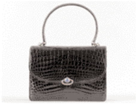
Fig 17. A Gucci black crocodile handbag, late 1960s, with Gucci stamp to the interior, with silvered metal and lapis lifter clasp, 21cm, 8.25in long. Provenance: Raine, Countess Spencer. £800.