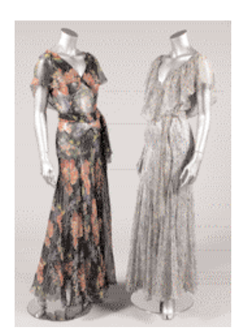
Fig 6. Six 1930s evening gowns, including floral chiffon, black mesh, sapphire blue velvet, blue and black printed chiffon and others. (qty) £420.