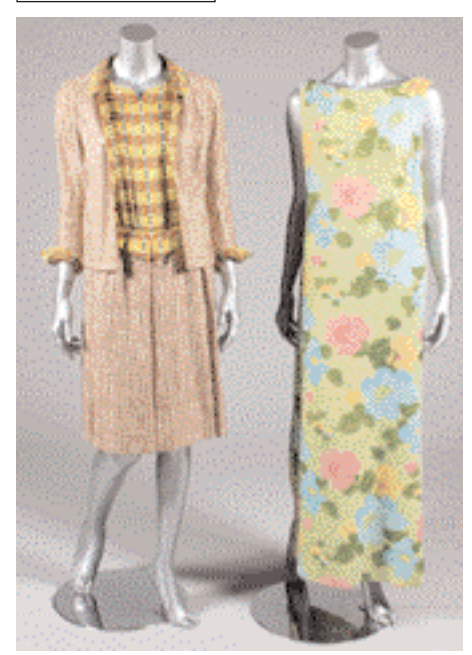
Fig 1. A Chanel couture cocktail suit, c1965, labelled and numbered 27160, of brown and ivory tweed-effect printed silk with gold lamé brocaded spots, the dress bodice and jacket lining of vibrant contrasting geometric printed silk, bust 106cm, 41in, waist 77cm, 30in, with a beaded floral evening gown, probably Hartnell, c1965. (3) £850.