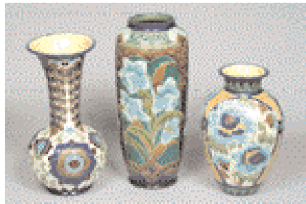
Large Burmantofts vases moulded and painted with flowers. Estimates £200-300 each.