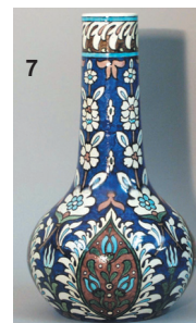
7 Burmantofts faience pottery vase of bottle form painted in lznik style with white flowers on a blue ground, design No. 68, signed L.K and numbered 347, 13.25in. Dee, Atkinson & Harrison, Driffield. Nov 04. HP: £700. ABP: £823.

Prices quoted are actual hammer prices (HP) and the Approximate Buyer's Price. (ABP) Includes an average premium of 15% + VAT.