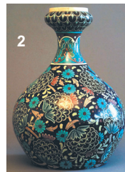
2 Burmantofts faience 'Anglo-Persian' vase, large proportions, probably decorated by Victor Kramer, in turquoise, blue, mauve & green, design inspired by William de Morgan, 20.5in, imp'd to underside 'Burmantofts Faience 25', artist's initials 'V' or 'LK', painted No. 42 design, also No. 264, bulbous rim broken and restuck. Canterbury Auction Galleries, Kent. Dec 05. HP: £2,100. ABP: £2,470.