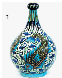
1 Burmantofts faience angle Persian vase by Louis Kramer, painted with a band of large fish in green/turquoise, ivory ground with blue fish, collet turquoise foot, signed monogram to base, impressed marks, 16.25in. Hartleys, Ilkley. Dec 99. HP: £800. ABP: £941.