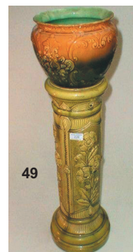
49 Burmantofts Faience jardiniere stand, decorated in green glaze, moulded with three floral panels, model No. 1984, together with an associated jardiniere. Golding Young & Co, Grantham. Nov 06. HP: £32. ABP: £37.