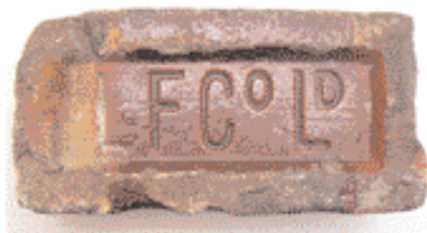
Glazed brick, c1900, manufactured by the Leeds Fireclay Company.