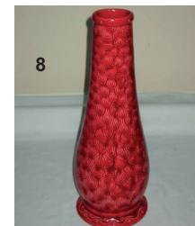
8 Burmantofts faience vase, tall bellied form, moulded rim, spreading foot, incised with stylized scales covered in a raspberry glaze, 15in high. Hartleys, Ilkley. Aug 06. HP: £654. ABP: £769.