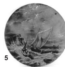
5 Burmantofts faience plaque, depicting fishing boats approaching the coast, green glazes, impressed mark, 17.75in.. Hartleys, Ilkley. Dec 99. HP: £800. ABP: £941.