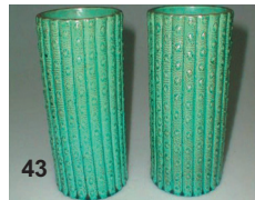
43 Pair of Burmantofts faience pottery sleeve vases, moulded in relief with reeded vertical panels & starbursts, turquoise glaze, impressed marks, No. 831, 8in high. Golding Young & Co, Grantham. Feb 06. HP: £70. ABP: £82.