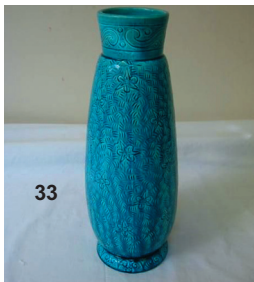
33 Burmantofts faience vase, flared rim, incised with stylised flowerheads, in a turquoise glaze, spreading foot, 15.5in high. Hartleys, Ilkley. Oct 06. HP: £160. ABP: £188.