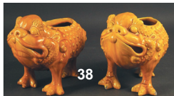
38 Two Burmantofts yellow glazed pottery jardiniere in form of grotesque animals, each on three clawed feet, 8 x 5.5 x 7in high, one with impressed factory mark, one rear leg repaired. Canterbury Auction Galleries, Kent. Feb 06. HP: £130. ABP: £152.