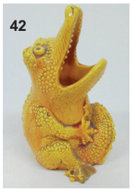
42 Burmantofts majolica novelty vase modelled as a crocodile with open mouth, 6.5in. Gorringes, Lewes. Sep 00. HP: £70. ABP: £82.