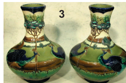
3 Pair of Burmantofts faience vases, incised peacock decoration in blue/green enamels, 23cm high, imp'd No. 2202. Ambrose, Loughton. Mar 02. HP: £1,100. ABP: £1,293.