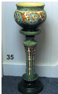
35 Burmantofts faience bulbous jardiniere and matching pedestal, leaf moulded bodies decorated in brown and turquoise, jardiniere 12.75in dia x 12in high, cracked and repaired, pedestal 30in high, impressed mark to base with pattern No. 2153 and 2154, both with Cat. No. 74.