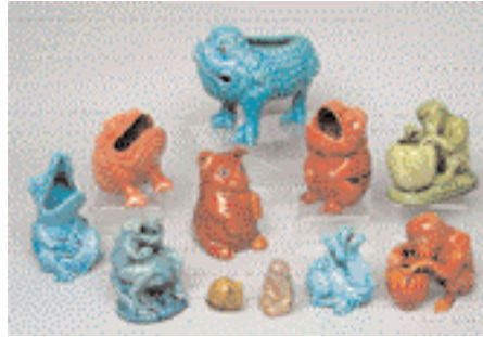
Selection of interesting Burmantofts animal models including spoon warmers. Estimates £100-400 each.