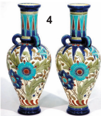
4 Pair of Burmantofts partie colour vases, triangular banding, small loop handles, tube lined with flowers in blue tones, cream ground, 16in high, mould No.2059. Andrew Hartley, Ilkley, W Yorks. Feb 06. HP: £850. ABP: £999.