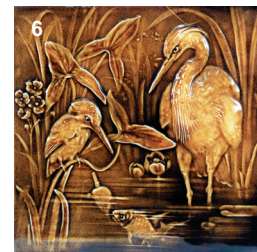
6 One of a pair of Burmantofts, faience green glaze tiles, relief moulded, 11.75in wide, unsigned, impressed marks to reverse. Hartleys, Ilkley. Feb 01. HP: £750. ABP: £882.

Prices quoted are actual hammer prices (HP) and the Approximate Buyer's Price. (ABP) Includes an average premium of 15% + VAT.