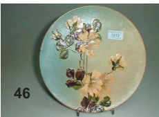
46 Burmantofts Faience wall plate, moulded in low relief and painted with blossom, blue ground, impressed mark, model No. 96, 10in. Golding Young & Co, Grantham. Feb 06. HP: £50. ABP: £58.