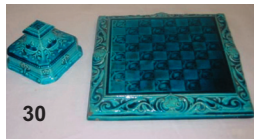
30 Burmantofts faience draughts board, turquoise glaze with foliate moulded border, 8.25in wide, and a canted square paper weight moulded with urns and stiff leaves, 3.5in wide. (2) Hartleys, Ilkley. Oct 06. HP: £190. ABP: £223.