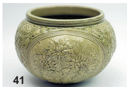
41 Late Victorian Burmantofts green glaze earthenware jardiniere, moulded floral decoration, 9in. Gorringes, Bexhill. Mar 02. HP: £85. ABP: £99.