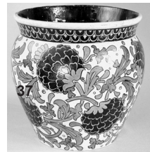
37 Late 19thC Burmantoft's Iznik jardiniere, design No. 52 and 240, 27.5cm dia. Cheffins, Cambridge. Sep 01. HP: £130. ABP: £152.