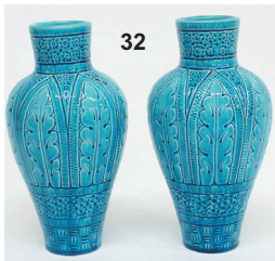
32 Pair of Burmantofts aesthetic blue majolica vases, incised floral decoration, pattern No.1666, both chipped, 8.5in.s Gorringes, Bexhill. Mar 02. HP: £170. ABP: £199.