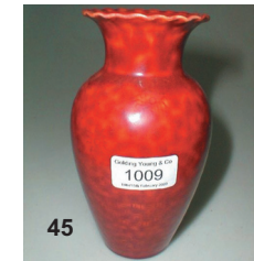
45 Burmantofts Pottery vase, flared frill rim, decorated with basket weave base and starbursts, mottled red glaze, impressed mark and shape No. 773, 6in high. Golding Young & Co, Grantham. Feb 06. HP: £52. ABP: £61.