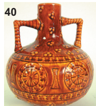
40 Burmantoft faience pottery twin handled vase, tapered cylindrical neck angled ribbed handles, embossed pattern covered in yellow and red glaze, 15cm high, impressed factory marks and initialled 'J.T.'. Rosebery's, London. Sep 04. HP: £100. ABP: £117.