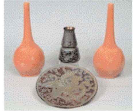
Pair of pink ground Burmantofts bottle vases. Estimate £200-300. Burmantofts lustre vase decorated with fish. Estimate £300-500. Burmantofts lustre plaque decorated with a griffin. Estimate £300-500.