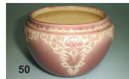
50 Burmantofts pottery small jardiniere, pale lilac ground intaglio moulded with floral and foliate panels, pendant from the scalloped rim, impressed marks, No. 1085, 7in dia. Golding Young & Co, Grantham. Feb 06. HP: £30. ABP: £35.