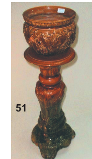
51 Burmantofts style jardiniere stand, decorated in green and brown glaze, moulded with scrolls and shells in the Art Nouveau manner, together with an associated jardiniere. Golding Young & Co, Grantham. Nov 06. HP: £18. ABP: £21.