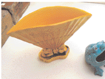
Yellow fan vase, c1885.

A representative display of the art potteries of Leeds, including Burmantofts can be seen in the Yorkshire Pots and Potteries Gallery at the Doncaster Museum and Art Gallery. Chequer Road, Doncaster DN1 2AE. Email: museum@doncaster.gov.uk . Telephone: 01302 734293. Fax: 01302 735409.