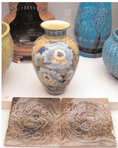
Large parti-ware vase, c1895, and two decorative tiles, c1890.