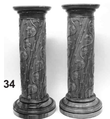
34 Pair of Venetian blue glaze Burmantofts pedestals, moulded with trailing ivy, 3ft 6in. Gorringes, Bexhill. Dec 01. HP: £140. ABP: £164.