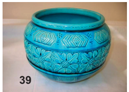
39 Burmantofts faience jardiniere, moulded with a band of flower heads above zig-zag banding, covered in a turquoise glaze, 10.5in wide, No 1424. Hartleys, Ilkley. Oct 06. HP: £120. ABP: £141.