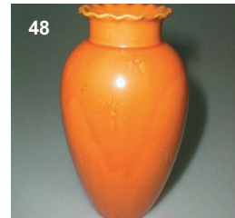
48 Burmantofts vase, frill edge neck, overall deep yellow ground incised with small sun bursts, 6in high. Golding Young & Co, Grantham. Feb 06. HP: £40. ABP: £47.