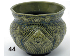
44 Burmantofts jardiniere, impressed geometric design, green glaze, impressed mark, Burmantofts Faience England, shape No. 2052A, 5.5in. Gorringes, Lewes. Jan 04. HP: £55. ABP: £64.