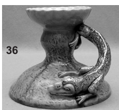
36 Chamber candlestick c1900, green/ochre majolica and lustre glazes, handle modelled as a lizard, impressed 'Burmantoft Faience 834', 12cm dia at base. Richard Winterton Auctioneers, Burton on Trent, Staffs. Sep 01. HP: £130. ABP: £152.

This section is only a sample from 1000s of results from recent sales. See our website for an extensive selection.