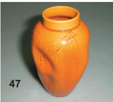
47 Burmantofts vase, undulating ovoid body, incised with starbursts, deep yellow body, impressed monogram, shape No. 236, 6in high. Golding Young & Co, Grantham. Feb 06. HP: £42. ABP: £49.