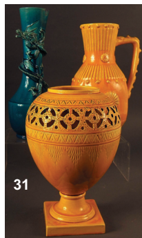
31 Burmantofts faience yellow glazed urn pattern vases with pierced/textured banding, square footrim, 9.75in high, impressed mark to base, slight damage to piercing, a similar Hungarian moulded ewer with raised circular paterae, 11in, and a Chinese turquoise glazed vase with moulded dragon entwined to neck, 12in high. Canterbury Auction Galleries, Kent. Apr 07. HP: £180. ABP: £211.