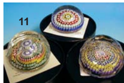
11 Three Whitefriars millefiori glass paperweights. Potteries Specialist Auctions, Stoke on Trent. Mar 03. £210.