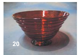
20 1960s Whitefriars red waisted bowl 10.5in. Denhams, Warnham, West Sussex. Jan 05. £70.