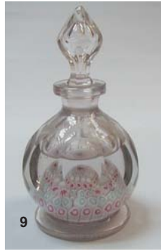
9 A 19thC Millefiori paper-weight scent bottle with a white, red and blue floret cushion, engraved shoulder with mono 'EK', facet cut blown stopper, possibly Whitefriars, 6.25in high, slightly af. Tring Market Auctions, Tring. May 02. £240.