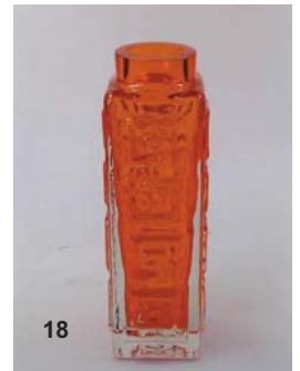
18 A Whitefriars Greek key pattern vase designed by Geoffrey Baxter, the square section body with circular neck in tangerine, 20cm high. Cheffins, Cambridge. Feb 05. £80.