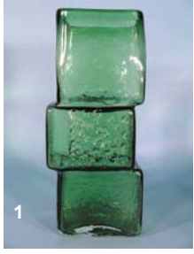
1 Whitefriars tall Drunken Bricklayers vase, designed by Geoffrey Baxter, square, asymmetrical design, in an 'emerald' tone glass, 13in high. Halls Fine Art, Shrewsbury. Apr 05. £1,000.

Price quoted are hammer prices. Adding 15% will give an approximation to the buying price.