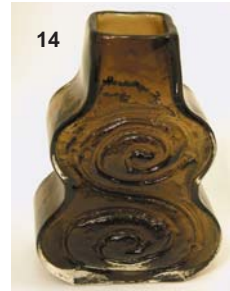
14 Whitefriars cinnamon glass 'Guitar' vase, designed by G. Baxter, 1967, spiral design in a textured finish, pattern no. 9675, 7.25in. Gorrings, Lewes. Oct 04. £160.