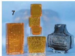
7 Three pieces of mid 20thC Whitefriars orange moulded glassware including 'Drunken bricklayer' vase and two others together with a bottle shaped grey glass vase, 21.5 x 11.5cm. Locke & England, Leamington Spa. Sep 04. £400.