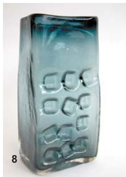
8 Whitefriars Kingfisher mobile phone 9668 vase, by Geoffrey Baxter, 26.7cm high, in indigo. Rosebery's, London. Sep 04. £260.