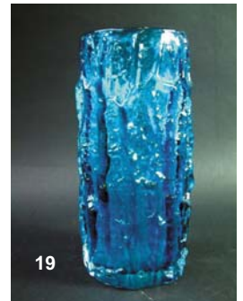
19 Whitefriars glass, large textured bark vase in kingfisher blue, designed by Geoffrey Baxter, c1960, 23cm high. Rosebery's, London. Mar 05. £70.