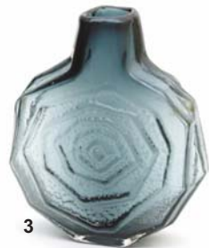
3 Whitefriars 'Banjo' vase, designed by Geoffrey Baxter, bluish grey colour, unmarked, 32cm high. Hampton & Littlewood, Exeter. Jul 04. £740.