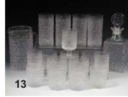
13 Part set of Whitefriars glacier pattern glassware designed 1969, G Baxter, comprising: decanter, jug, eleven assorted tumblers, four beakers and three goblets. (21) Sworders, Stansted Mountfitchet. Apr 05. £160.