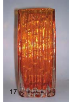
17 Whitefriars textured rectangular tangerine vase with bamboo effect front, designed by Geoffrey Baxter, 21cm high. Cheffins, Cambridge. Apr 05. £110.