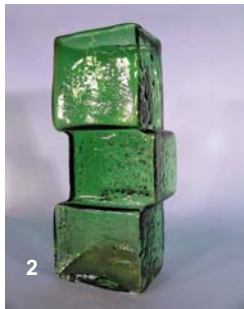
2 Whitefriars tall Drunken Bricklayer vase designed by Geoffrey Baxter, in an 'emerald' toned glass, 13in high. Halls Fine Art, Shrewsbury. Mar 05. £800.