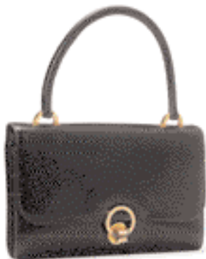
Fig 10. Lot 352. A black box leather 'Ring' bag, Hermès, circa 1955. Goldtone metal hardware, 26 cm. Stamped 'HERMÈS, PARIS' to the interior. £1,000. Christies: prices incl. buyer's premium 25%.