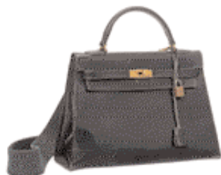
Fig 12. Lot 319. A navy blue leather 'Kelly' bag, Hermès, 1969. Goldtone metal hardware, with padlock, keyfob and toile shoulder strap, 32 cm. £813. Christies: prices incl. buyer's premium 25%.