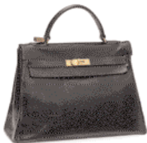
Fig 11. Lot 315. A black box leather 'Kelly' bag, Hermès, 1970. Goldtone metal hardware, with padlock, 32 cm. £875. Christies: prices incl. buyer's premium 25%.