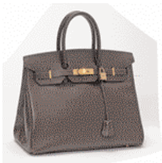
Fig 7. Lot 303. A chocolate brown 'Birkin' bag, Hermès, 1997. Goldtone metal hardware, with padlock, keyfob and dustbag 35 cm. £5000 Christies: prices incl. buyer's premium 25%.