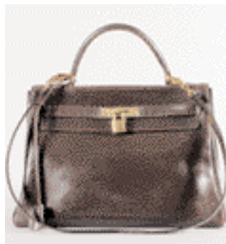
Fig 3. Lot 22. A Hermès dark brown leather Kelly bag, late 1960s, stamped under the closure flap Hermès Paris, with padlock, fob with two keys, brass padlock, optional shoulder strap, 32cm, 12.5in long. Hammer Price: £950. Kerry Taylor Auctions.