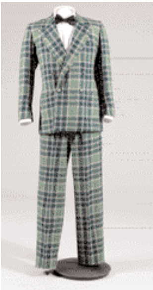
Fig 15. Lot 44. H.R.H. the Duke of Windsor's Hunting Lord of the Isles tartan evening suit, 1951, woven in shades of green and white wool, the Scholte double-breasted jacket labelled and indistinctly annotated 'H.R.H. the Duke of Windsor', dated 8.6.51 and numbered 2719, with wide lapels, side vents, curved cuffs with three buttons; the matching trousers by Harris of New York, zip fastened, with narrow tapering legs to the ankle; together with a Hawes & Curtis matching backless waistcoat, no 4996, and cummerbund; a Scholte dark green corduroy backless waistcoat, bearing the Duke's name, dated 8.10.47, no 189493; and two Hawes & Curtis white pique highland style dress-waistcoats chest 97cm, 38in, waist 74cm, 29in. (7) Kerry Taylor Auctions.