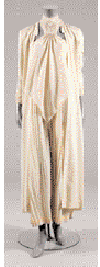
Fig 21. Lot 170. The Bill Gibb ivory wool ensemble worn by Lulu for her wedding to John Frieda in 1976, labelled, comprising: halter neck gown, collar with beaded palmettes and fringes in shades of grey, handkerchief point to the front bodice hem, pleated skirt edged in pastel ribbons; matching full length coat with similarly beaded shoulders, rear yoke and cuffs, bust approx 81-86cm, 32-34in. With a newspaper article written by Lulu showing her photographed in the gown. (3) Lulu has confirmed that this is indeed the outfit she wore for her marriage to the hairdresser John Frieda. In her memoirs she records 'The wedding was at Hampstead Register Office, that October (1976) and Bill Gibb, a Scottish designer, created an Arabian style gown in pale cream wool for me. We did three fittings to make sure everything was absolutely right.' The dress was purchased in an antiques/second hand shop in Margate in 1991. The shopkeeper stated that the dress had belonged to Lulu (who had been appearing in the Winter Gardens the previous season there). Hammer Price: £650. Kerry Taylor Auctions.