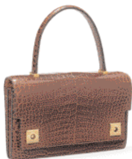
Fig 9. Lot 350. A russet brown crocodile 'Piano' bag, Hermès, early 1960s. Goldtone metal hardware, with associated pair of lorgnettes in crocodile case, coin purse and mirror, 26 cm. Stamped 'HERMÈS, PARIS, MADE IN FRANCE' in gilt. £1,750. Christies: prices incl. buyer's premium 25%.