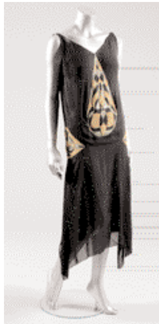
Fig 20. Lot 122. A rare and important Madeleine Vionnet evening gown, model 4113, Spring-Summer, 1925, of black crêpe romain, with Lesage embroidered droplet shaped motif to central bodice worked in silver strip and copper beads, the hips with similar, more rounded motifs, the hem falling in points at each side, bust 86cm, 34in. £50,000. Kerry Taylor Auctions. Hammer Price.