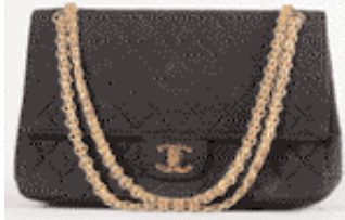
Fig 1. Lot 1. A Chanel black quilted jersey 2.55 bag, 1960s, with gilt CC clasp, gilt chain handle, wine leather interior, 25.5cm, 10in long. Hammer Price: £500. Kerry Taylor Auctions.

Of the fifty-eight Hermès bags in the Christies 'Elegance - handbags' sale in May, the top seller (Lot 305 Fig 6 ) was similar to the one at Kerry Taylor's mentioned above, though only one year old, and raised £48,050, £20,000 above the