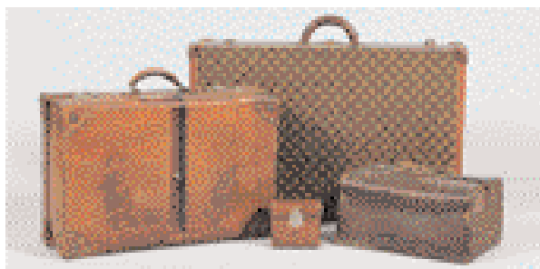
Fig 13. Lot 41. A Louis Vuitton suitcase, with traditional LV canvas, leather handle and trim, brass lock engraved LV H8, initialled to the top in red ECJ, 52cm, 20.5in high, 80cm, 31.5in long, 21cm, 8.5in wide, with a leather gladstone case, a brown leather suitcase with black and wine painted stripes, a small leather box (4) Hammer Price: £850. Kerry Taylor Auctions.

high end estimate. Even given that this price included £20% buyers premium, that is some difference. Perhaps like cars, Hermès handbags depreciate every year they are on the road!