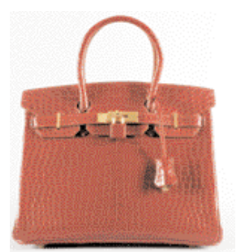
Fig 5. Lot 11. A fine Hermès red crocodile Birkin, Crocodylus Porosus, blind stamp A square, with gilt hardware, stamped below the closure flap Hermès Paris made in France, with inverted V, with key fob, leather covered padlock and dustbag, 30cm, 11.75in. Hammer Price: Kerry Taylor Auctions.