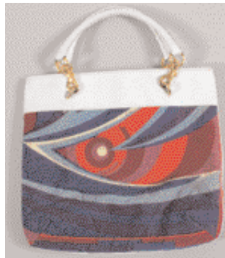
Fig 2. Lot 24. A Pucci printed velvet and leather beach bag, early 1970s, 41cm, 16in wide, in original box. (2) Hammer Price: £150. Kerry Taylor Auctions.