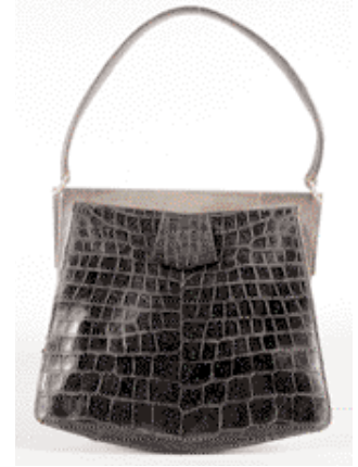
Fig 4. Lot 15. A rare and early Hermès 'Isabeau' black crocodile handbag, 1930s, Crocodylus Porosus, engraved to the interior Hermès, Paris, the silvered angular mounts with ingenious opening device - the plated lower handle flange sections are spring-mounted to pull apart allowing the central frame to open, lined in grey suede, 21cm, 8in high. Hammer Price: £950. Kerry Taylor Auctions.