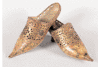
Fig 19. Lot 64. A fine and rare pair of gilded and painted carved wood ladies shoes, Italian, Dutch or French, second half 17thC, pierced and carved gesso and lacquered wood, exaggerated pointed toes painted with tulips and dog roses, upper with lace-effect piercings with faux lachets and eyelets for threading ribbons, foliate medallions and hearts, curved and gilded low set heels with faux stitch marks up the centre back and also to the sides of the upper, interiors painted with faux ermine flecks, crimson painted soles with felt pads to heel and ball of foot, one applied with an old collection/museum label, 'mules bois sculpté et doré. Travail Venetian du XVIII S.' 29cm, 11.5in long. (2) Literature: A single, similar carved wooden shoe is illustrated in 'Schuhe' by Saskia Durian-Ress (1991) catalogue no 57, pp 59-61. A very similar pair are in the Northampton Shoe Museum and they are dated 1650-75 and were purchased in France. Hammer Price: £8,000. Kerry Taylor Auctions.