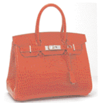
Fig 6. Lot 305. A Braise Crocodile 'Birkin' bag, Hermès, 2011. Silver palladium hardware, with padlock, keyfob, dustbag, raincovers and box. Crocodylus Porosus. 30 cm. £48,050. Christies: prices incl. buyer's premium 25%.