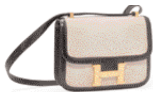
Fig 8. Lot 311. A brown leather and toile 'Constance' bag, Hermès, probably 1970s. Goldtone metal hardware, with dustbag, 22 cm.. Stamped 'HERMÈS, PARIS, MADE IN FRANCE' £3,750. Christies: prices incl. buyer's premium 25%.